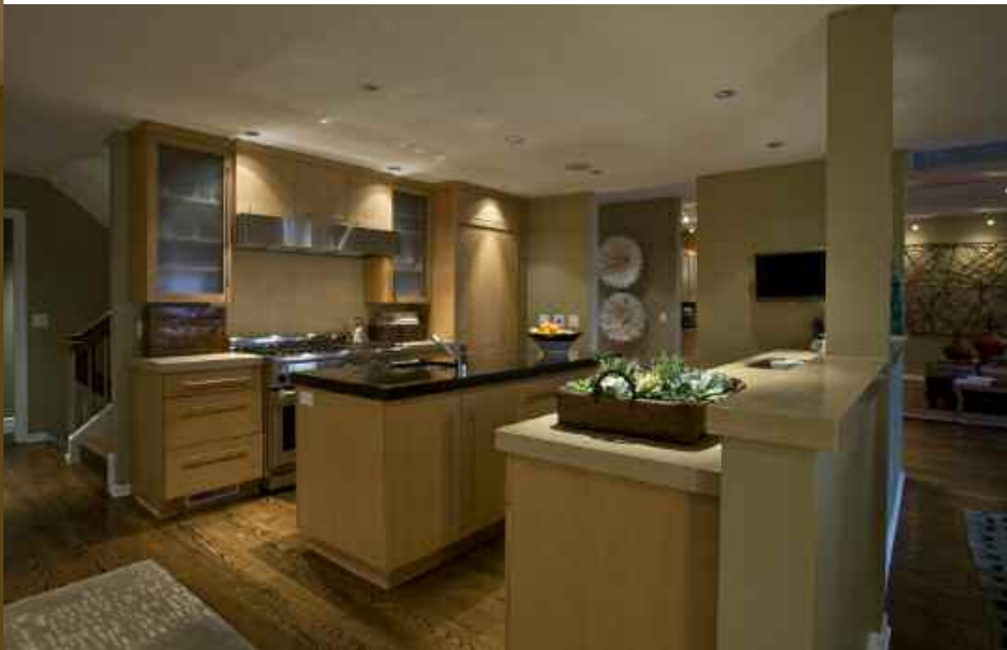
SQUARE MEALS The contemporary kitchen, which faces the lake and is outfitted with maple cabinets and limestone countertops, is the center of attention for family meals and entertaining.